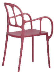
Matt colour Red 1484 C