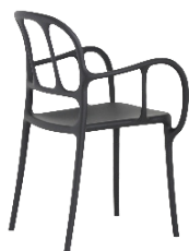
Matt colour Black 1769 C