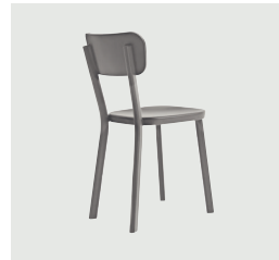
Sand Beige 5269