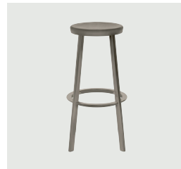
Sand Beige 5269